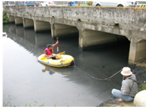
Fig. 2 Channel survey work on No Name Creek